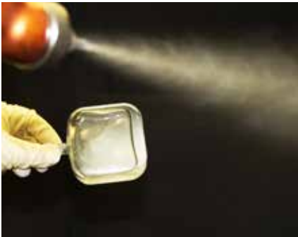
Applied by spraying (dilution: 25%)

* Rheomat RM 180, MS 33, D = 100 s -1 , 23 °C