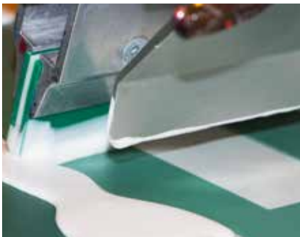
Applied by screen printing