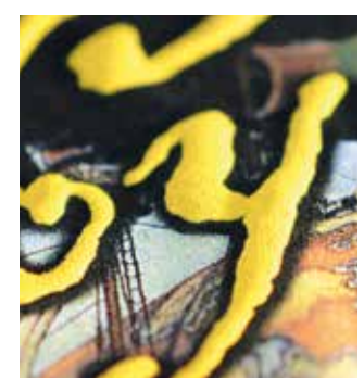
Puff ink applications on garments with SEFAR® BASIC 43/110-80W

SEFAR® BASIC is designed and manufactured for t-shirts, textile and ceramic printing applications.