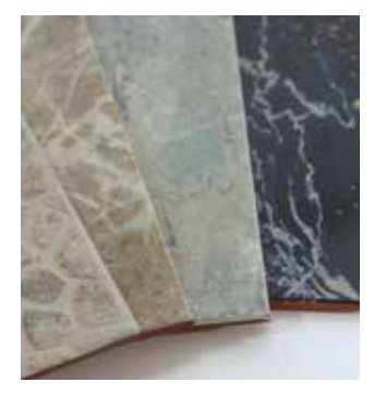
Structured and highly resistant floor tiles with SEFAR® BASIC 77/195-48W