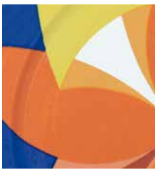
High color density on ceramics with SEFAR® BASIC 71/180-55W